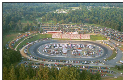
Lanier National Speedway will host the only stop for the NASCAR Whelen Southern Modified Tour in the "Peach State" of Georgia.